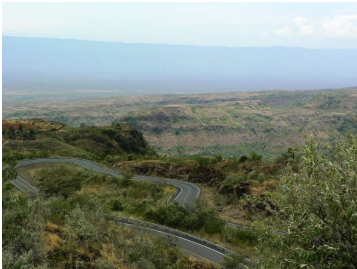
The old Rift Valley Road.